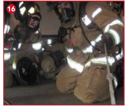
(14) Locating the victim. The officer is controlling the main line. (15) The team leader off to the side controlling rope. (16) The rescue or search team exiting with the victim.

main line: We are tethered or connected to it in some fashion. The keys to searching while using tethering are, again, simplicity and purposeful techniques in application. Many fire departments and their members get into trouble with tethering by using long tethers, which create management and entanglement problems, neither of which is welcome in a possibly compromising IDLH environment.