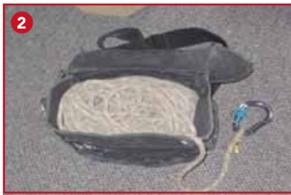
(2) A modern search rope bag.

a solid action plan that incorporates proper sectoring and accountability of all team members. The large-area search rope system must be appropriate for the type of search. The tools and equipment used must enhance the search's effectiveness and ensure the safety of the personnel. The members conducting the search using a rope should have the following: