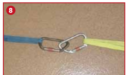
(5) Overhand knot on a bight in the main line with tether. (6) Free Gate tether unattended. (7) Double extended tether. (8) Double extended tether, carabiner to carabiner.