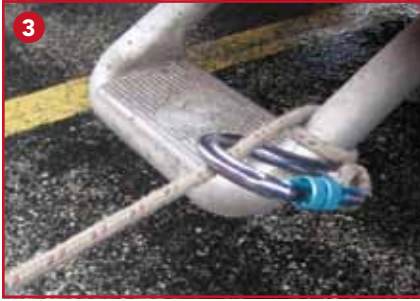
(3) Outside anchors need to be solid.