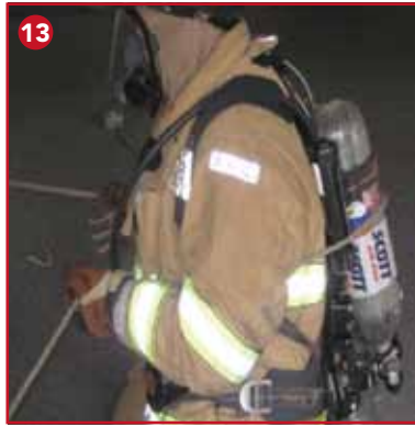
(13) Another human anchor position—the bottle wrap.

ficer conducts a thermal scan of the entryway and decides on the point and direction of travel. The team leader should provide a quick look of the scan to the second-position member as well, for orientation. This confirms the decision on the direction of travel. Many times, the distressed firefighter can be seen immediately; other times, an alerting PASS device or radio communication will determine the direction of travel. In the case of civilians, the team should obtain solid information on the area of the victim's location prior to entry (photos 9-12).