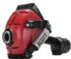
EAGLE IMAGER 320 WITH PAK TRACKER TECHNOLOGY

Pak Tracker™ helps you simplify training, reduce equipment load and, most importantly, quickly respond to downed firefighters. Light, glove-friendly and technologically advanced, Eagle Imager 320 with Pak Tracker can turn any team into a RIT team. To learn more, visit the product center at scotthss.com/320paktracker .