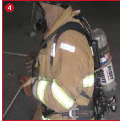
(4) The human anchor position with bottle wrap.