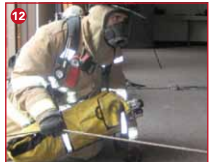
(9) First position team leader with rope bag and thermal imaging camera. (10) Second position search member on rope line, the tool man. (11) Third position search member on rope line, specialty man. (12) Fourth position search member RIT breathing system bag man.